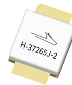
GTVA123501FA Package H-37265J-2

Advance Specification Data Sheets describe products that are being considered by Wolfspeed for development and market introduction. The target performance shown in Advance Specifications is not final and should not be used for any design activity. Please contact Wolfspeed about the future availability of these products.